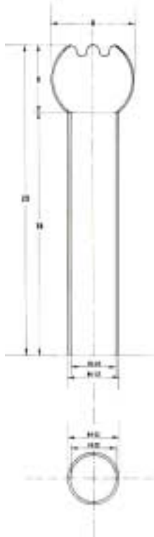
עמודי ה"נחשת" "כיף" "בעז"

= (“Kings 1” 7- -15-22). = (“Jeremiah” 52- -21).